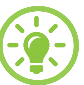
Coaching & Support