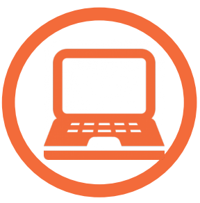
Online Training Programs